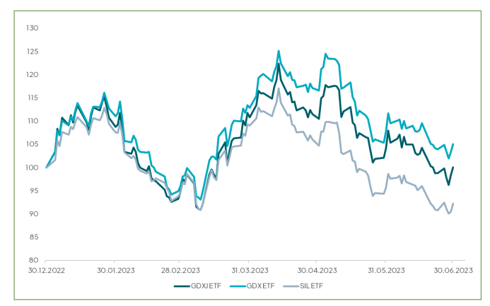
Fig. 1: GDX, GDXJ, SIL – Performance comparison H1 2023

Performance variances within the individual segments were large in HI. Silver miners were over 12% behind the large gold miners (as measured by GDX ETF). The smaller gold miners (measured by the GDXJ ETF) were 5% behind GDX (Fig. 1).